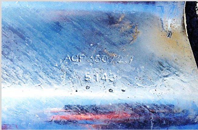
Typical view of the hard stamped details on the guardrail panel

Materials test certificates shall comply with the requirements of Clause 20.4.5.