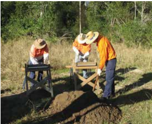
Test pitting was undertaken at many sites along the 26km new highway corridor as part of cultural heritage investigations.

The Department of Transport and Main Roads (TMR) recognises the significance of different cultures and the importance of managing Indigenous, historical, shared and natural heritage. Several archaeological, anthropological, ground penetrating radar surveys, cultural heritage surveys and investigations were undertaken to inform the development of a Cultural Heritage Management Plan for the project. This includes surveys by the Registered Native Title Group.