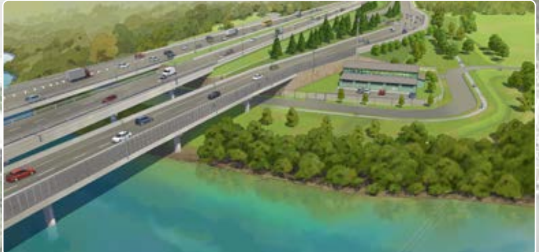
Tallebudgera Creek looking south towards Tugun

Active transport path transitions to new western service road