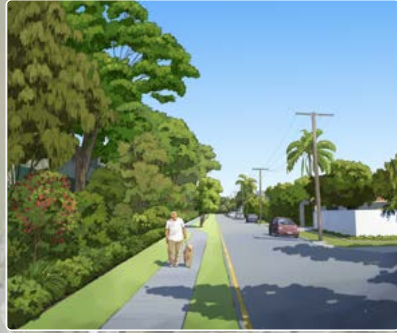
Waikiki Avenue southern end - vegetation at maturity