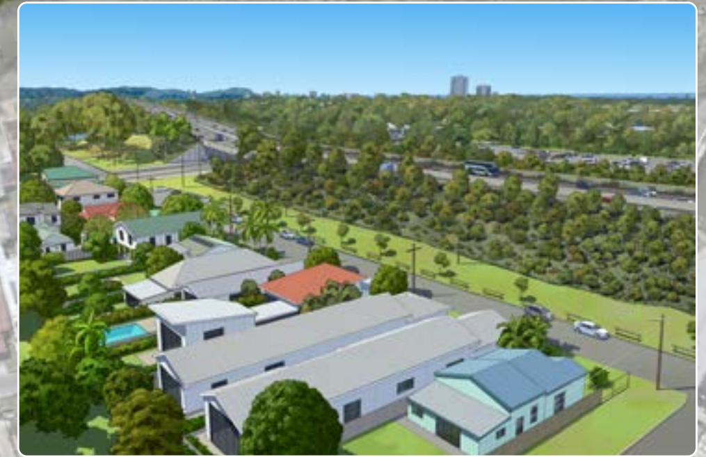
Station Street looking north towards Nerang