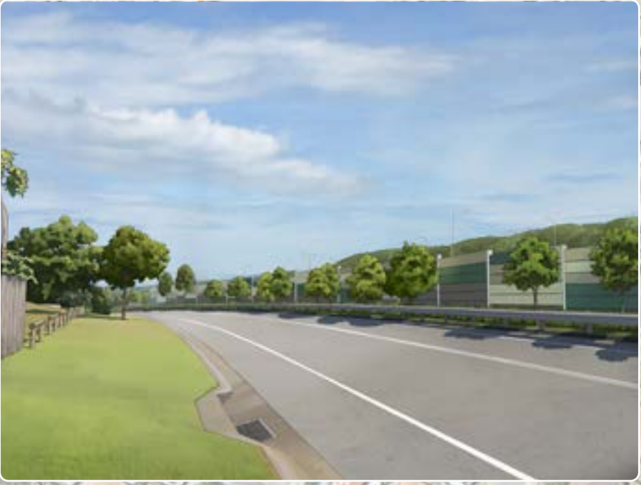
Oyster Creek Drive looking towards Nerang

A new dedicated active transport path on the western side of the M1